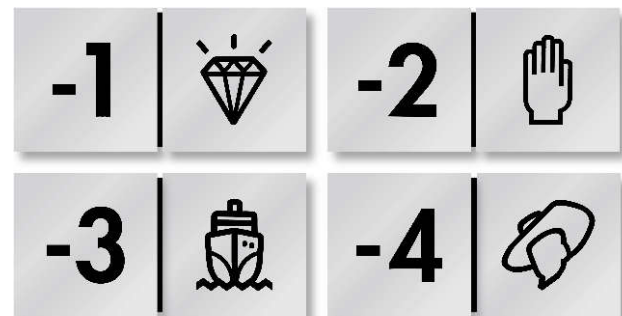
Figure 4: Bespoke Antwerp icons per parking level

Customers feel safe and secure thanks to: