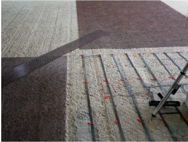
Carbon scrims on bare concrete slabs, with anode strips surrounding the supports to protect against cathodic corrosion (on the right)