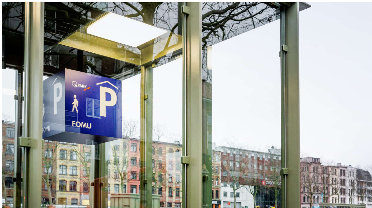
Figure 5: Pedestrian access/exit point near FOMU (Foto Museum)

Customers feel safe and secure thanks to: